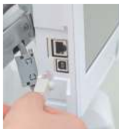
LAN and USB connection