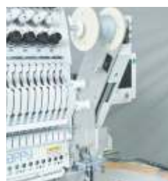
Zigzag Cording Device