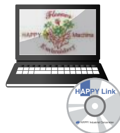
Editing function in HAPPY LAN/LINK software