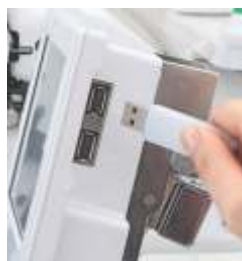
USB and Mouse

999 patterns memory 40,000,000 stitches memory